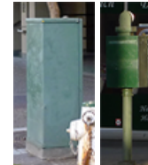
S SMALL/ MEDIUM BOX